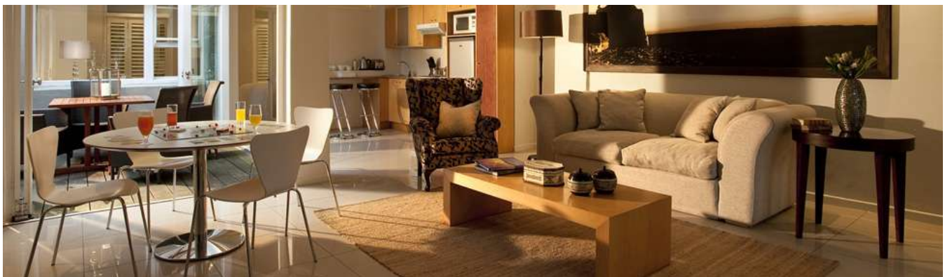
Accommodation: The More Quarters, Cape Town